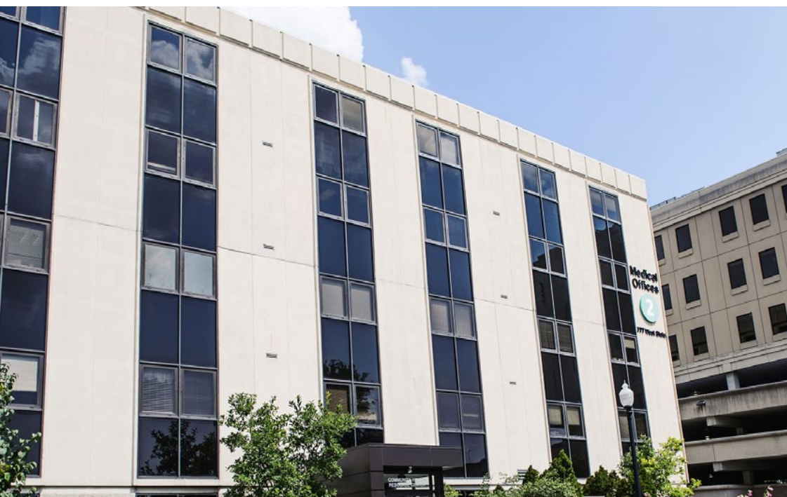
MOUNT CARMEL FRANKLINTON

Another option that you may prefer is to leave property or money in an endowment form so that the charity does not spend the principal. Instead, the charity spends the endowment income (as the donors often have done throughout their lives). Endowments may be left to community or religious foundations or often directly to the charity with instructions for their use. It is often helpful to suggest a general purpose for the endowment fund because it will last perpetually, and the original purpose for the gift may one day not exist. If you are interested in an endowment approach to your charitable gifts, please contact us.