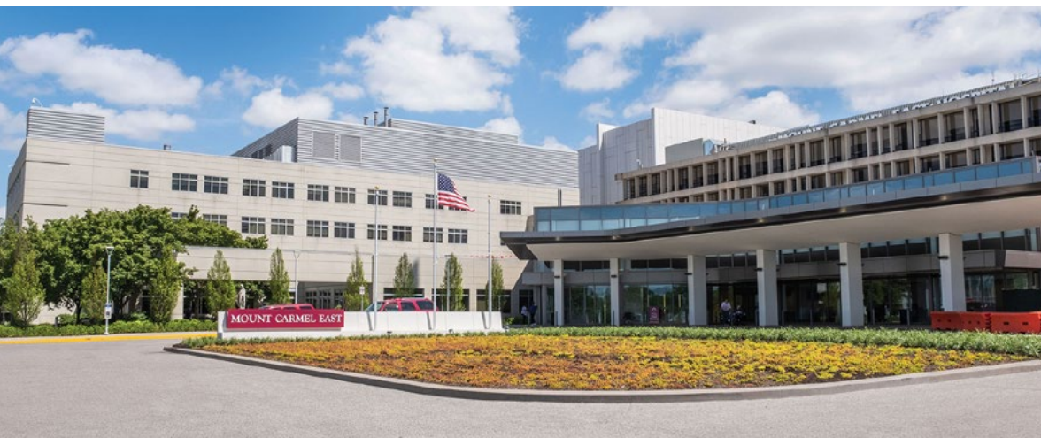
MOUNT CARMEL EAST